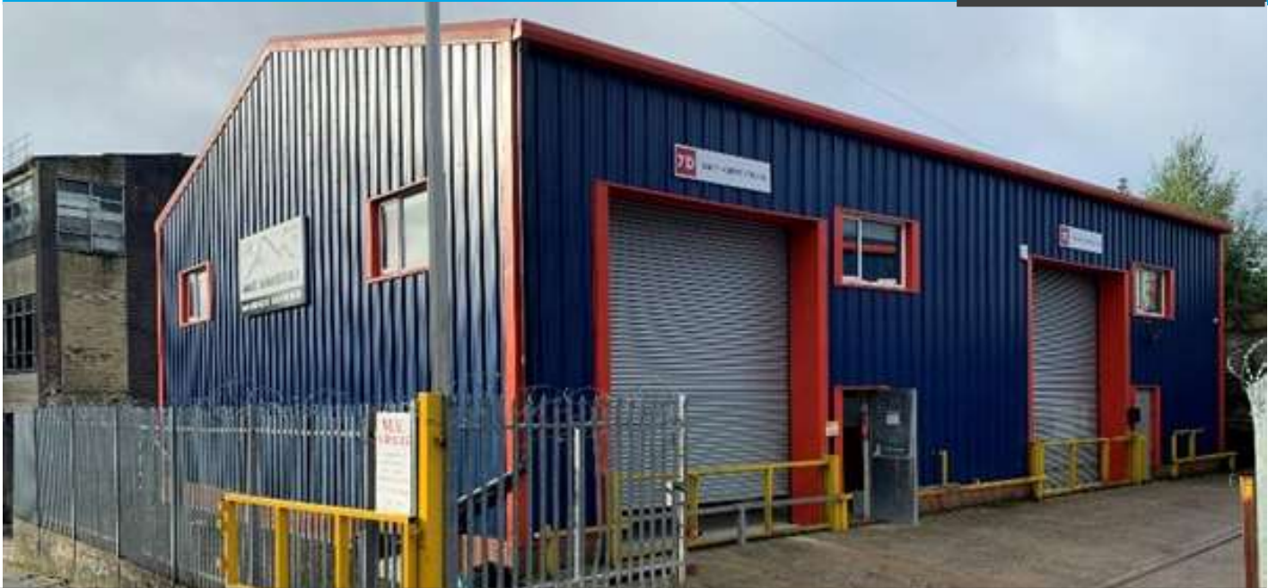
Unit 7D, Caldershaw Business Centre, Rochdale, OL12 7LQ