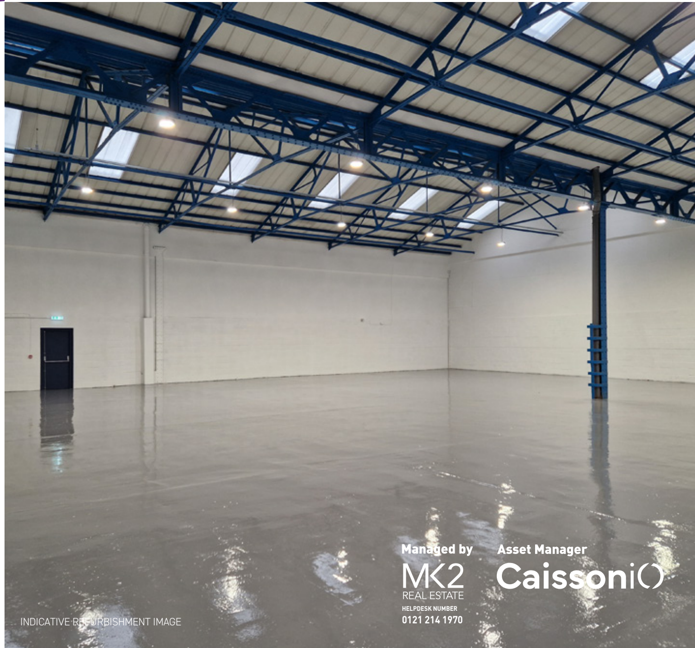
INDICATIVE REFURBISHMENT IMAGE

Designed by: Bliss Marketing 0161 367 7252