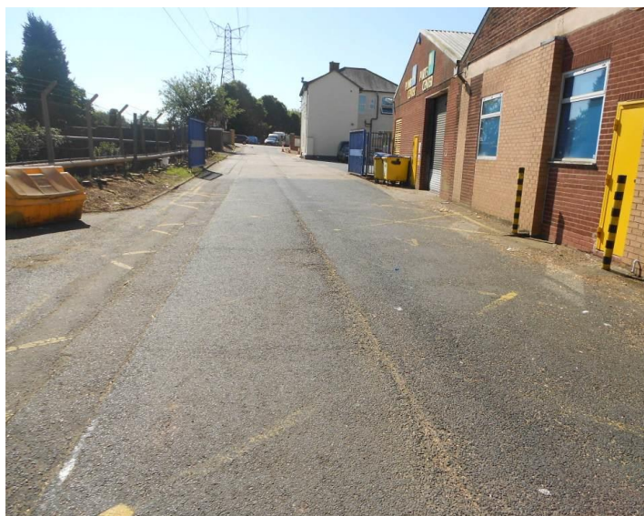
Main Entrance Driveway