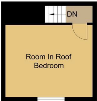
Room In Roof

These particulars, whilst believed to be accurate are set out as a general outline only for guidance and do not constitute any part of an offer or contract. Intending purchasers should not rely on them as statements of representation of fact, but must satisfy themselves by inspection or otherwise as to their accuracy. No person in this firms employment has the authority to make or give any representation or warranty in respect of the property.