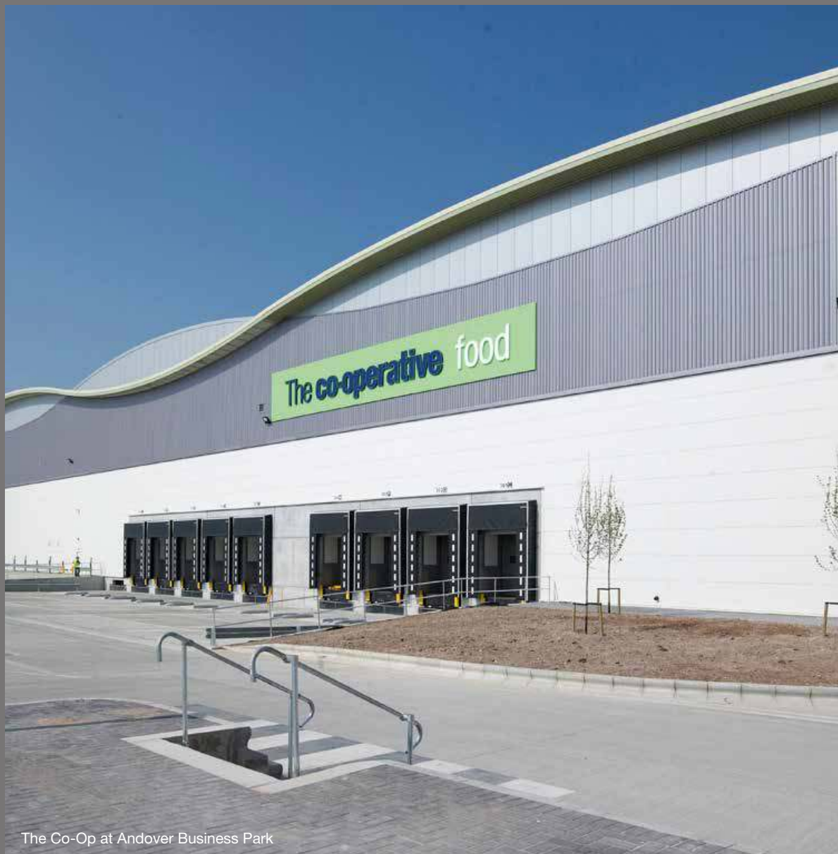
The Co-Op at Andover Business Park