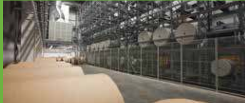
A 100,000 sq ft printing press facility at Thurrock Commercial Park for the Daily Mail

“ Goodman worked closely with us to secure planning for the 109,520 sq ft print centre. The speed of turnaround was remarkable, planning consent for the centre was secured in October 2011, and construction completed on schedule, in less than eight months. The delivery of this facility was a result of a strong working relationship between Goodman and Harmsworth Printing.