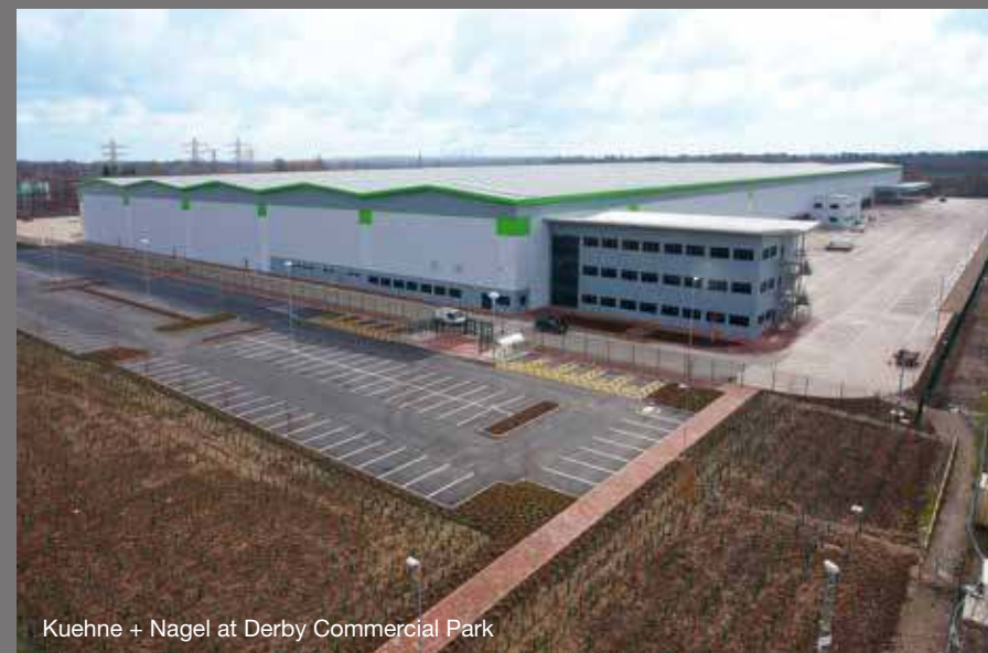
Kuehne + Nagel at Derby Commercial Park