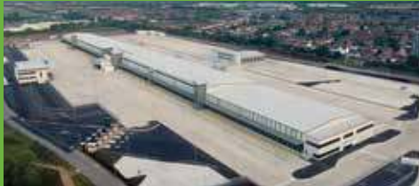
A 32.5 acre, 330,000 sq ft state of the art DPD parcel delivery hub at Hinckley Commerical Park

Goodman has a first class track record in delivering industrial, logistics and warehouse solutions for its customers. Some of our recent developments include: