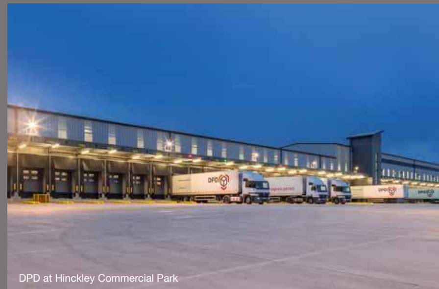
DPD at Hinckley Commercial Park