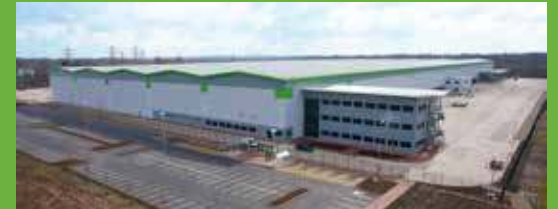
632,000 sq ft at Derby Commercial Park for Kuehne + Nagel Drinkflow Logistics and Heineken

“ Commercial Services is one of Kent's largest businesses. Having reorganised its corporate structure, the business is now in a position to seize the opportunities for further growth. The team at Goodman reacted swiftly in designing and costing a bespoke facility and concluding a deal to meet our demanding timetable. Goodman assisted in making the transition as smooth as possible and the building is progressing on time and to budget.