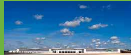
A 467,891 sq ft (43,484m 2 ) regional distribution centre (RDC) at Andover Business Park pre-let to The Co-operative Group

“ We have been delighted with Goodman's ability to deliver both the 470,000 sq ft building and a major infrastructure scheme on schedule. Their team was able to agree the details of this complex project swiftly and work in partnership with us to secure a successful project.