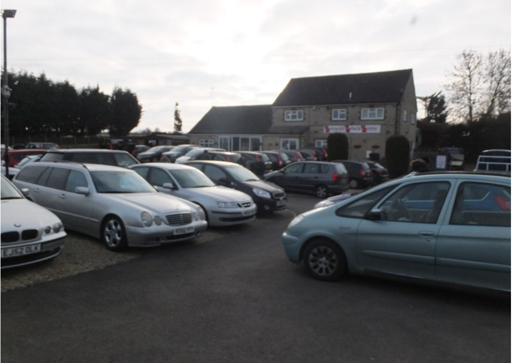
Rapleys LLP is registered as a Limited Liability Partnership in England and Wales. Registration No: OC308311. Registered Office at 33 Jermyn Street, London SW1Y 6DN. Regulated by RICS.

Any maps are for identification purposes only and should not be relied upon for accuracy. © Crown Copyright and database rights 2018 Licence No. 100004619.